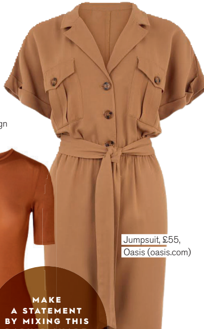
Jumpsuit, £55, Oasis (oasis.com)