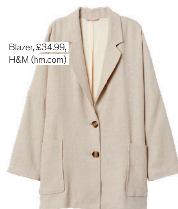
Blazer, £34.99, H&M (hm.com)