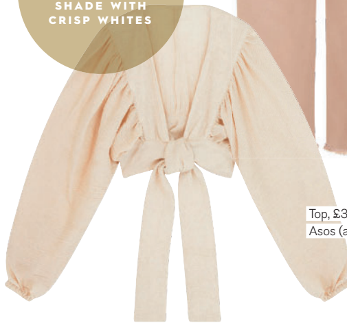
Top, £32, Asos (asos.com)

KEEP IT CLEAN AND FRESH BY MIXING THIS SHADE WITH CRISP WHITES