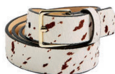
Belt, £16, Topshop (topshop.com)