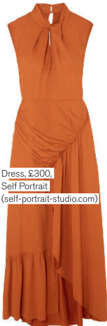
Dress, £300, Self Portrait (self-portrait-studio.com)

Autumn shades work for spring, too – this warm, earthy tone is as tasteful as it is trans-seasonal