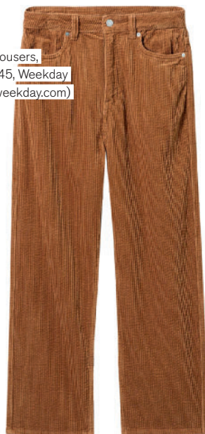
Trousers, £45, Weekday (weekday.com)