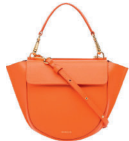
Bag, £565, Wandler (wandler.com)