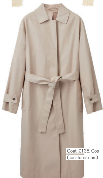
Coat, £135, Cos (cosstores.com)