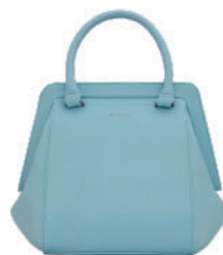
Bag, £125, Matt & Nat (mattandnat.com)