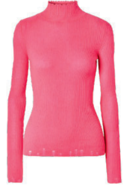
Top, £345, Les Réveries (net-a-porter.com)