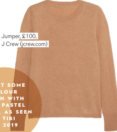
Jumper, £100, J Crew (jcrew.com)