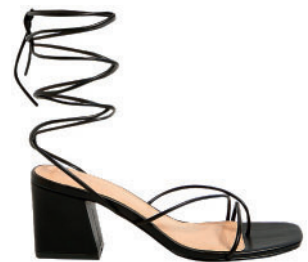
Shoes, £52, Urban Outfitters (urbanoutfitters.com)