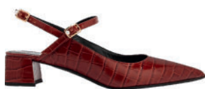
Shoes, £475, Erdem (net-a-porter.com)