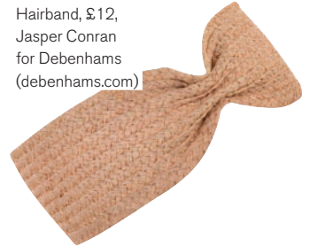
Hairband, £12, Jasper Conran for Debenhams (debenhams.com)

INJECT SOME COLOUR CLASH WITH PALE PASTEL PIECES, AS SEEN AT TIBI S/S 2019