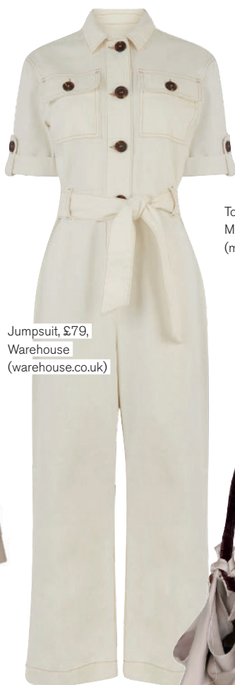
Jumpsuit, £79, Warehouse (warehouse.co.uk)