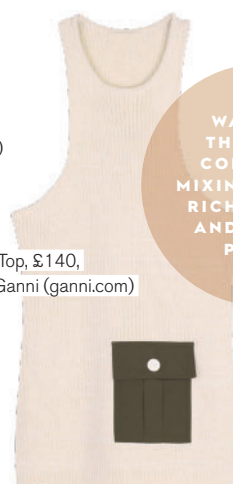
Top, £140, Ganni (ganni.com)