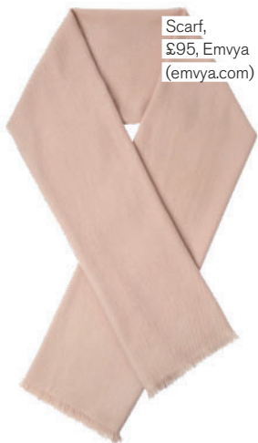
Scarf, £95, Emvya (emvya.com)

The perfect new neutral, this sophisticated colour is best styled with gold jewellery