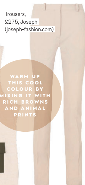
Trousers, £275, Joseph (joseph-fashion.com)

WARM UP THIS COOL COLOUR BY MIXING IT WITH RICH BROWNS AND ANIMAL PRINTS