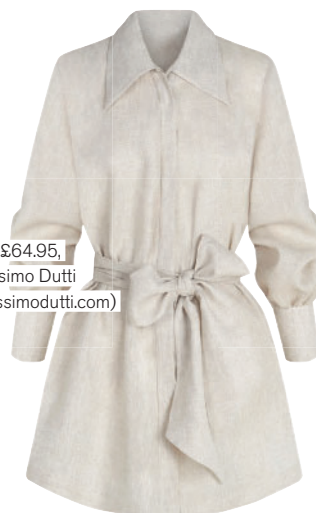
Top, £64.95, Massimo Dutti (massimodutti.com)