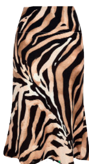
Skirt, £32, River Island (riverisland.com)