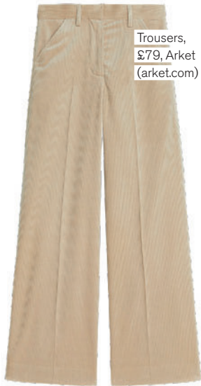
Trousers, £79, Arket (arket.com)

KEEP IT CLEAN AND FRESH BY MIXING THIS SHADE WITH CRISP WHITES