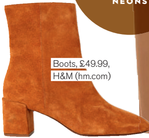
Boots, £49.99, H&M (hm.com)

MAKE A STATEMENT BY MIXING THIS DARKER SHADE WITH LIVELY NEONS