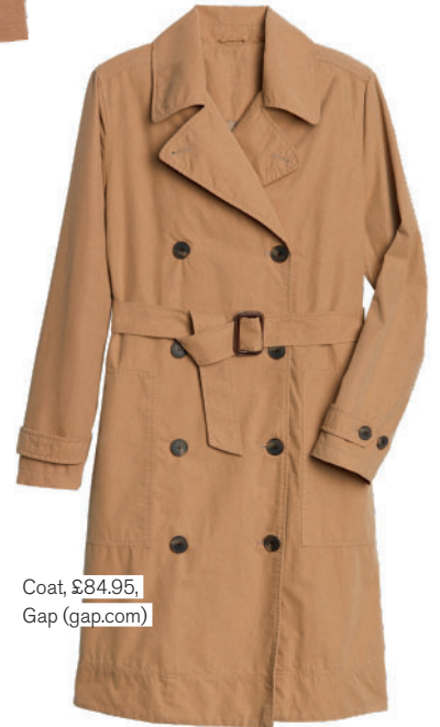
Coat, £84.95, Gap (gap.com)