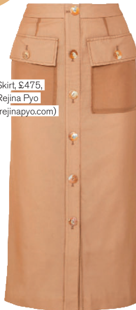
Skirt, £475, Rejina Pyo (rejinapyo.com)