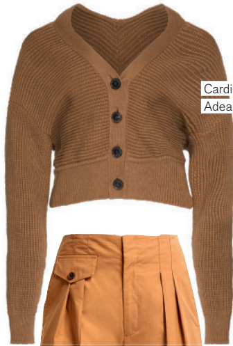
Cardigan, £555, Adeam (adeam.com)