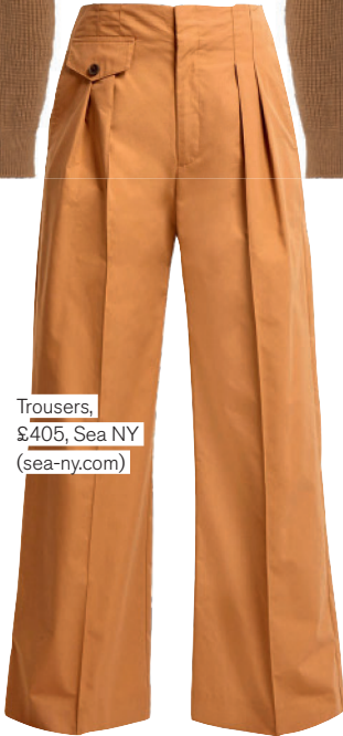
Trousers, £405, Sea NY (sea-ny.com)