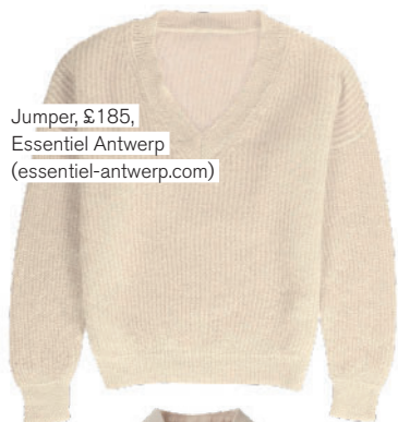
Jumper, £185, Essentiel Antwerp (essentiel-antwerp.com)

The ultimate palette cleanser, this season's stone shades are cool, calm and collected