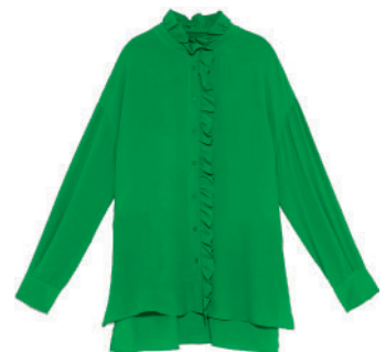
Top, £29.99, Zara (zara.com)