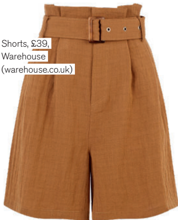
Shorts, £39, Warehouse (warehouse.co.uk)