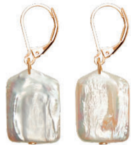
Earrings, £15.99, Mango (mango.com)