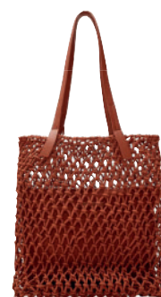
Bag, £29.99, Zara (zara.com)