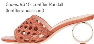
Shoes, £345, Loeffler Randall (loefflerandall.com)