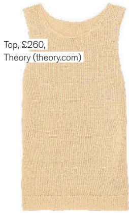
Top, £260, Theory (theory.com)