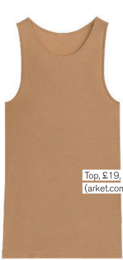
Top, £19, Arket (arket.com)

Rich and creamy, this buttery brown hue is best worn tonally for maximum impact