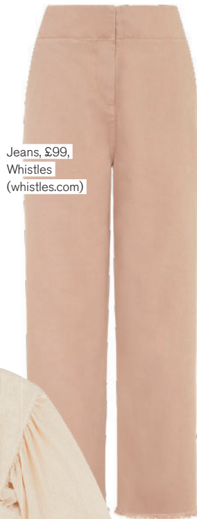
Jeans, £99, Whistles (whistles.com)