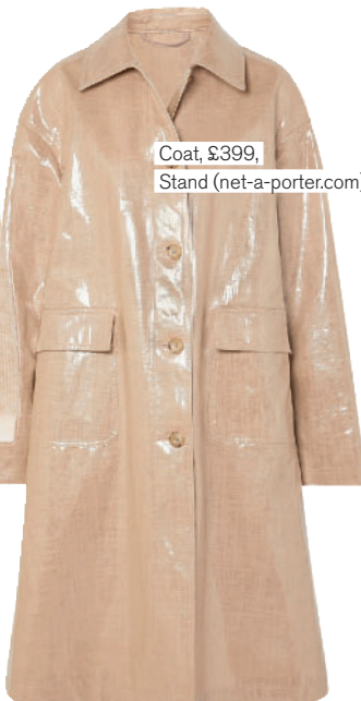
Coat, £399, Stand (net-a-porter.com)