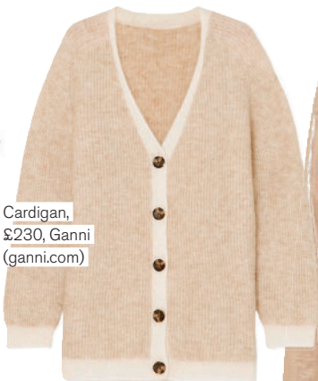
Cardigan, £230, Ganni (ganni.com)