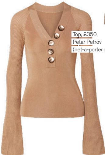
Top, £350, Petar Petrov (net-a-porter.com)

INJECT SOME COLOUR CLASH WITH PALE PASTEL PIECES, AS SEEN AT TIBI S/S 2019