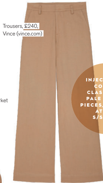
Trousers, £240, Vince (vince.com)