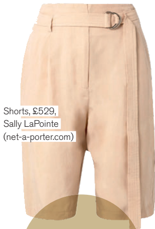
Shorts, £529, Sally LaPointe (net-a-porter.com)