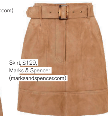
Skirt, £129, Marks & Spencer (marksandspencer.com)