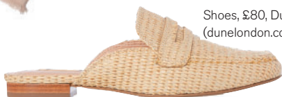
Shoes, £80, Dune (dunelondon.com)