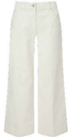
Jeans, £90, Jigsaw (jigsaw-online.com)