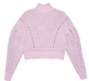
Jumper, £39, Topshop (topshop.com)