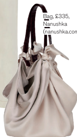
Bag, £335, Nanushka (nanushka.com)