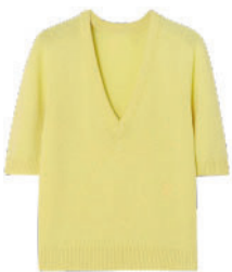
Jumper, £655, Chloé (chloe.com)